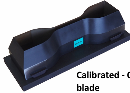
Calibrated - CNC cutting blade